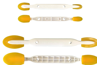
Finishing Pads (silicone)